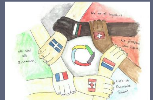
Our student Melis Bay's drawing